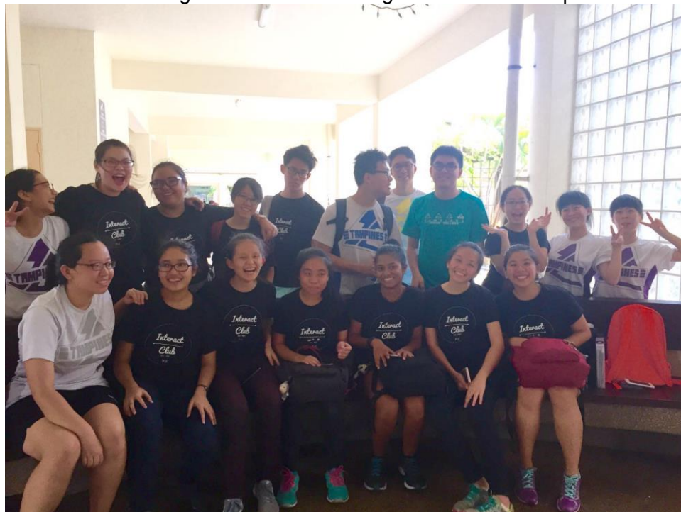
Post-event Group Photograph