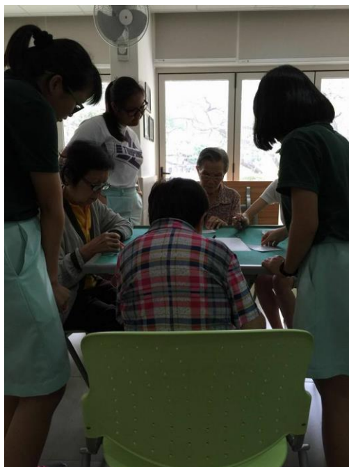
Elderly playing Bingo game