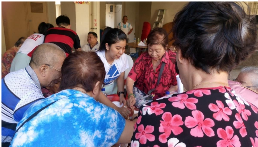
Lohei With the Elderly

After the event, many of the elderly shook hands with the Interactors and the teachers to thank them for organizing the event. This event has not only brought festive cheers to the elderly, it also brought about satisfaction to the students who worked hard to make the event a success.