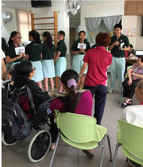
Playing Memory games with the Elderly

St. Luke's ElderCare (Tampines) is a day rehab centre and provides social day care services. TPJC Interact Club members visit the centre weekly to interact with the elderly. They planned various activities to engage the elderly meaningfully. These invaluable experiences allow our students to gain a greater awareness of how to bridge the intergenerational gap and bond with the senior citizens.