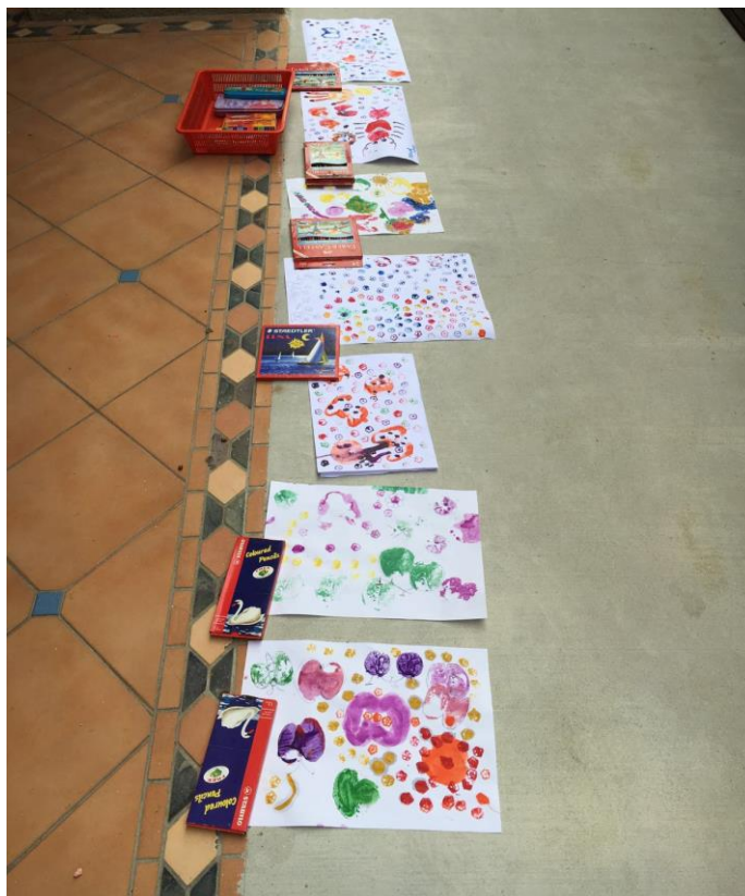
The elderly's end product from the Vegetable stamping.