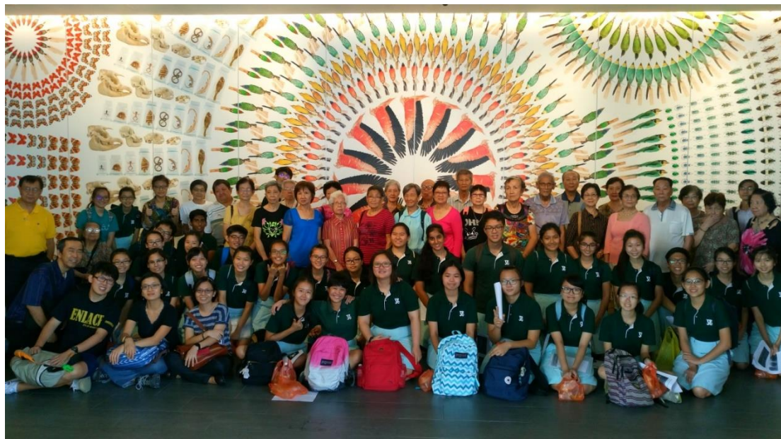
Group Photo at the End of the Event