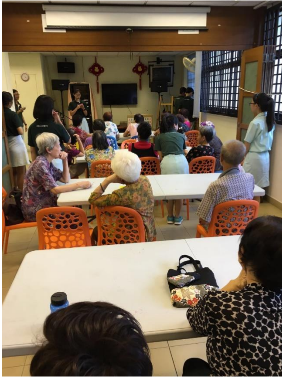
Elderly enjoying a talk on osteoporosis