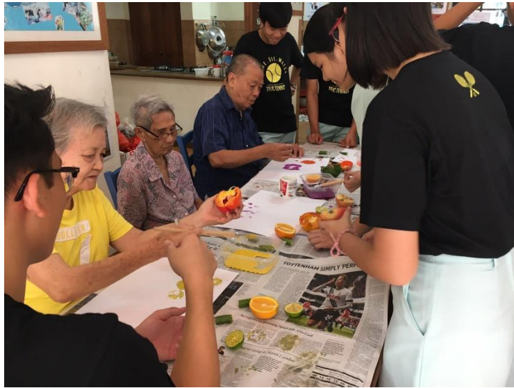
The elderly doing Vegetable stamping