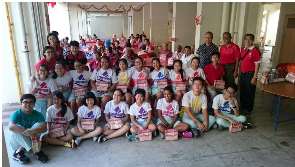
Group Photograph With All Organisers and Participants