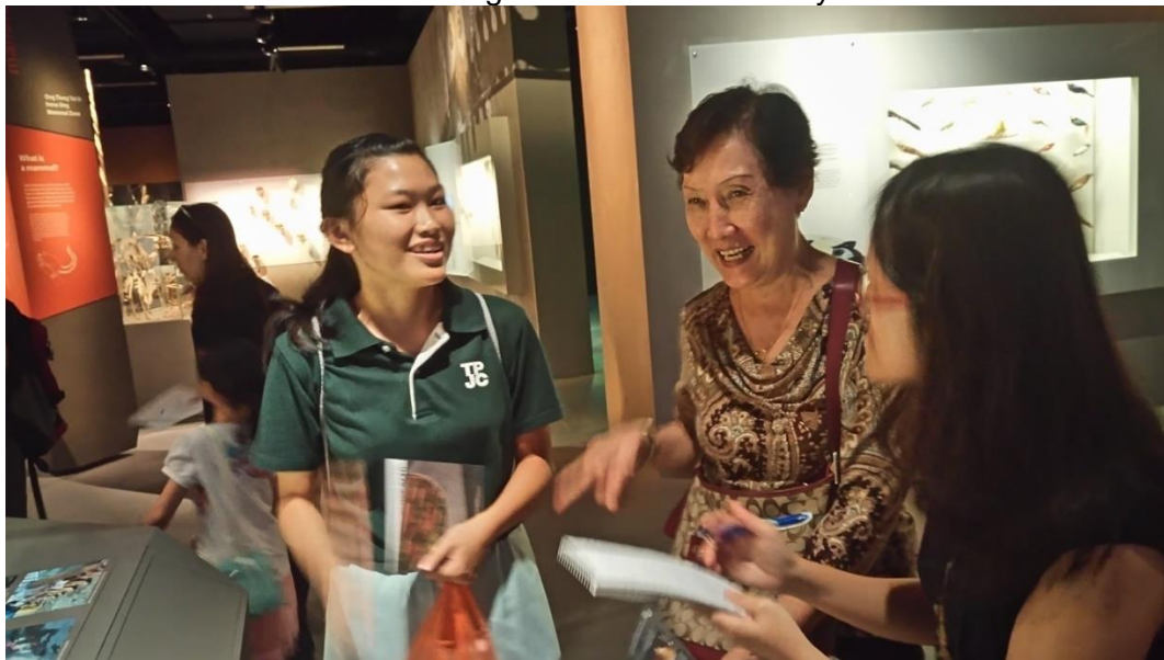
Interacting Together with Members of Public in the Museum