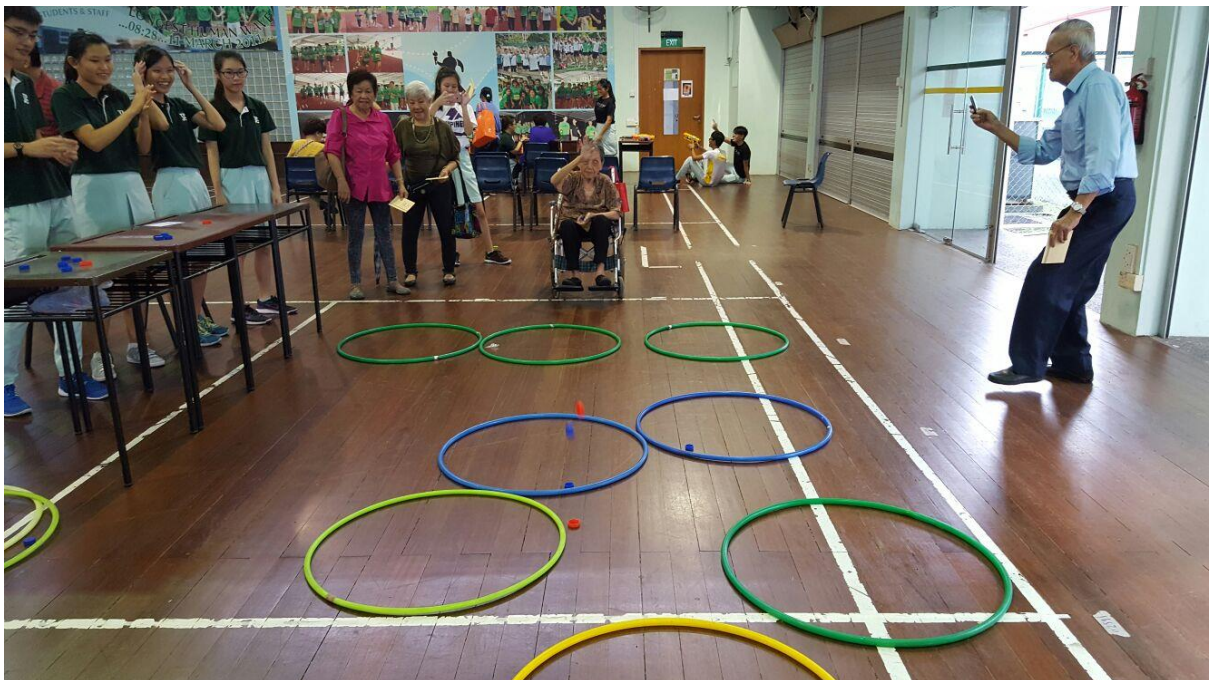
Cheering the elderly on for the game of bocchia