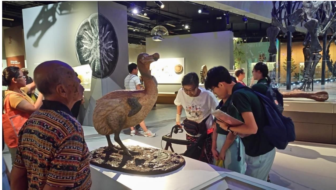
Students and Elderly Looking for Clues for Treasure Hunt Game