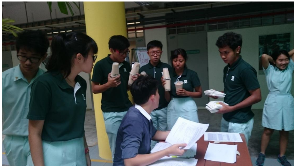
Students collecting their pre-ordered bubble tea