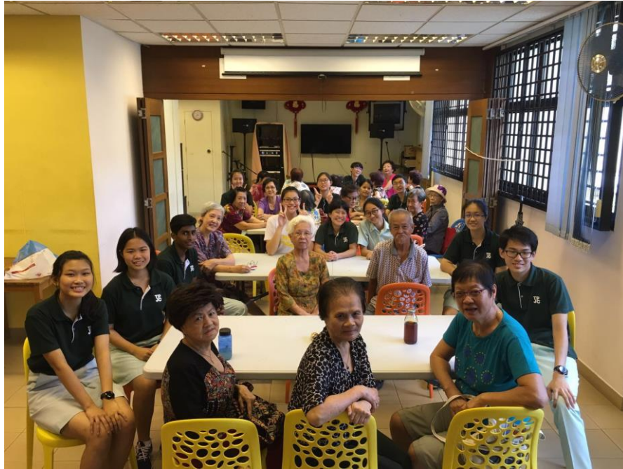
A group photo taken after discussions on the topic.