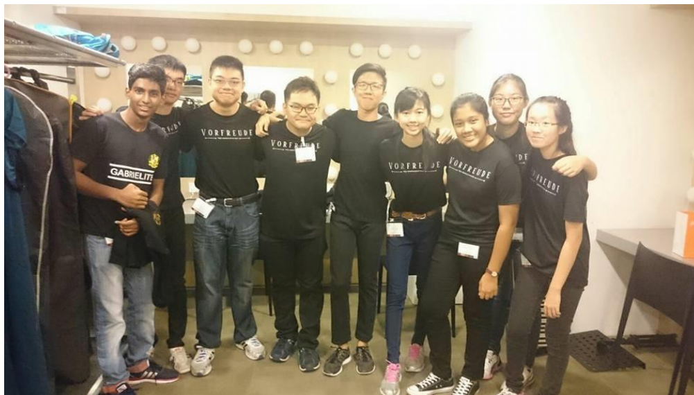
The backstage crew