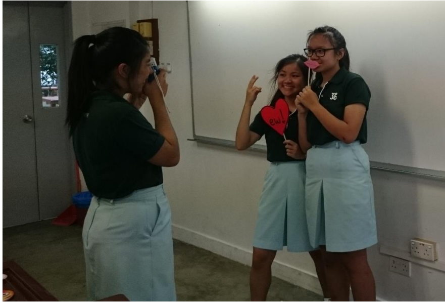
Students taking photo at the polaroid booth