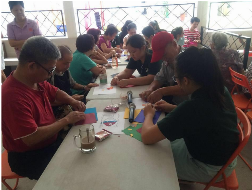
Elderly doing paper Mosaic

The 811 wellness@west centre was set up this year at the void deck of Blk 811 Tampines St 81. The wellness centre provide the facilities for the elderly to meet up, have tea and participate in activities run by Volunteers. The students started having activities with the elderly since February this year. They planned and execute a range of activities for the elderly.