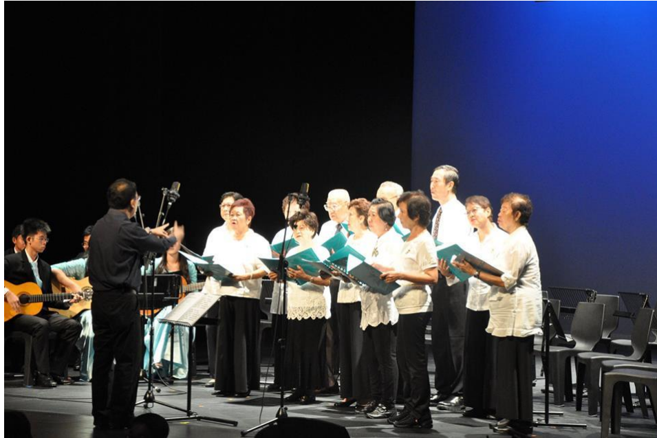
Evergreen Elderly singing on Victoria theatre stage

TAMPINES JUNIOR COLLEGE 2 Tampines Ave 9. Singapore 529564 Tel: (65) 67841955 Fax: (65) 67810061 Website: http://www.tampinesjc.moe.edu.sg E-mail: tpjc@moe.edu.sg