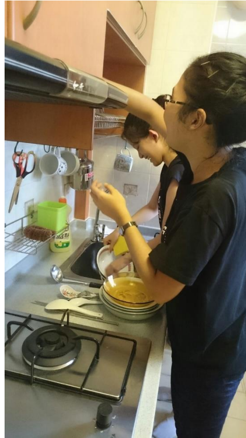
Photo showing the students cleaning the dishes and cupboards