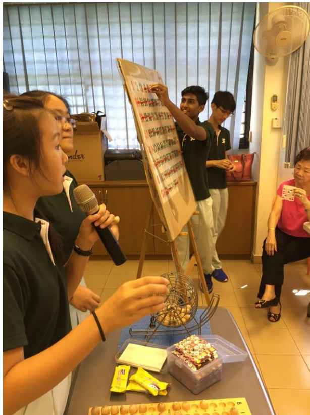
The Bingo segment

Most of the elderly at Evergreen Circle are quite active and most of them are mobile. Initially the students started with simple art and crafts, singing sessions, memory games, Jenga and Bingo with the elderly. When the interactors understand the elderly better, they began to change their perspective of elderly and became more confident of coming out with more interactive games for them. They were really satisfied when they saw that the elderly were enjoying themselves very much.