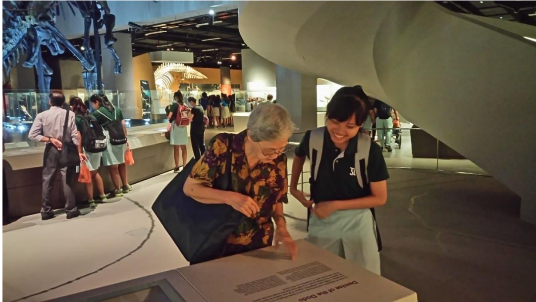
Translating Exhibits for the Elderly