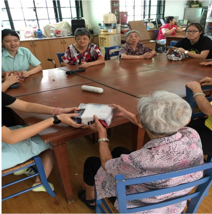
The elderly passing the parcel