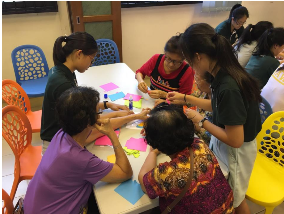
Paper mosaic activity, which the elderly were highly engaged in.