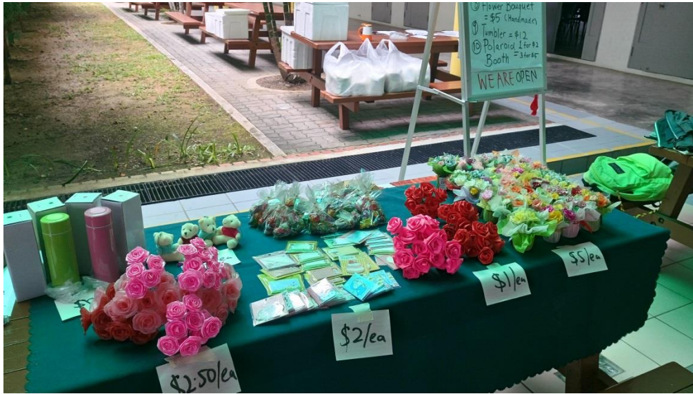
Interact Booth Right Before Opening