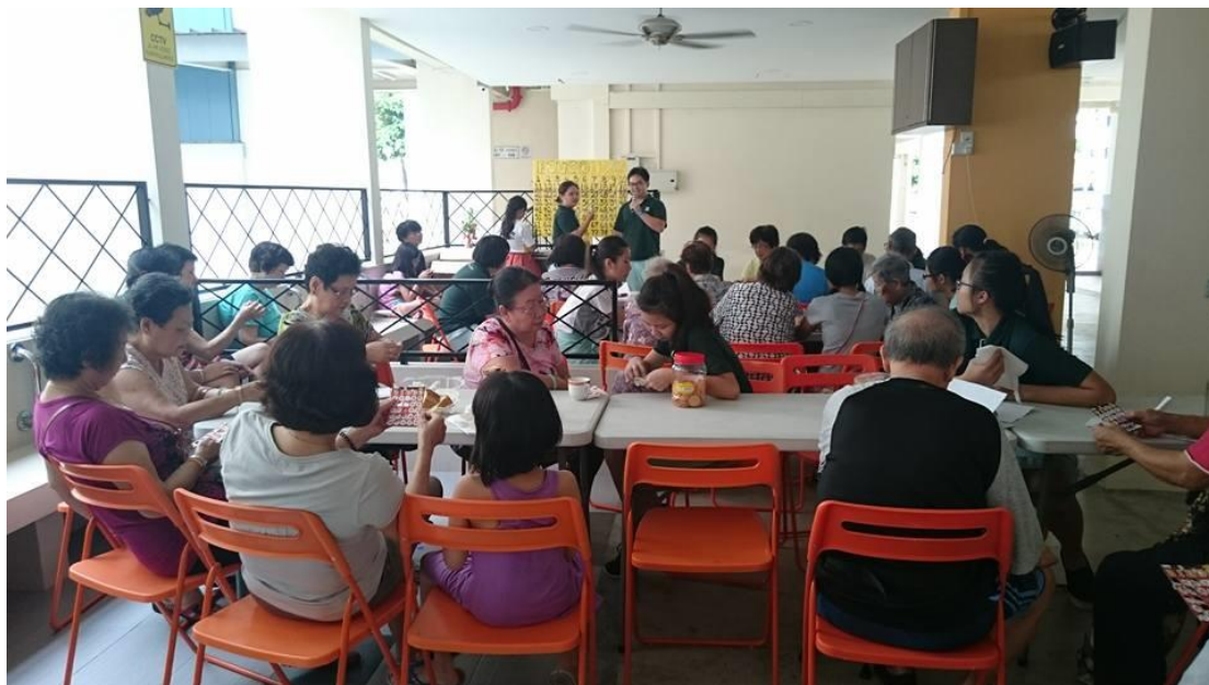
The elderly playing their favourite Bingo game