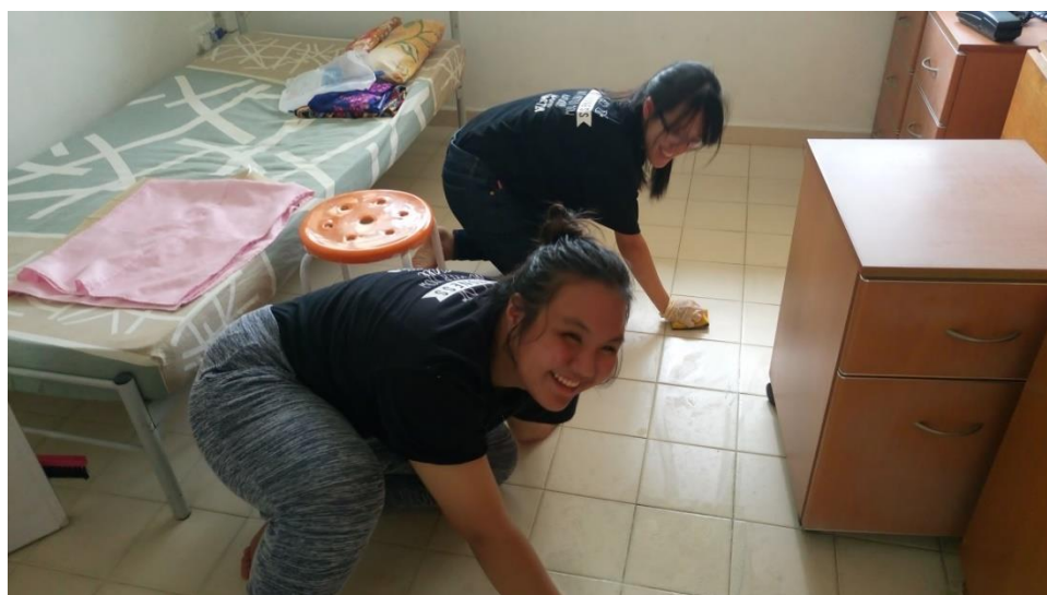
Photo showing the students scrubbing the floors for the elderly

On 29 th of January 2016, TPJC's Interact Club visited the homes of the seniors staying at Evergreen Circle Neighbourhood Link (Block 827A Tampines St 81) to aid them in spring cleaning their homes for the upcoming Chinese New Year. Students were engaged in activities such as cleaning of windows and fans, painting wall corners, wiping cupboards, and scrubbing the floors. As these activities often require energy and balance, the elderly were appreciative that there were someone to lend a helping hand this year. Through the activity, students learnt to empathize with the elderly and understood the importance of teamwork. They also reflected that although what they had done might only help in a small way but they gained a great deal of satisfaction through interactions with the elderly and kind gestures shown to them by the elderly.