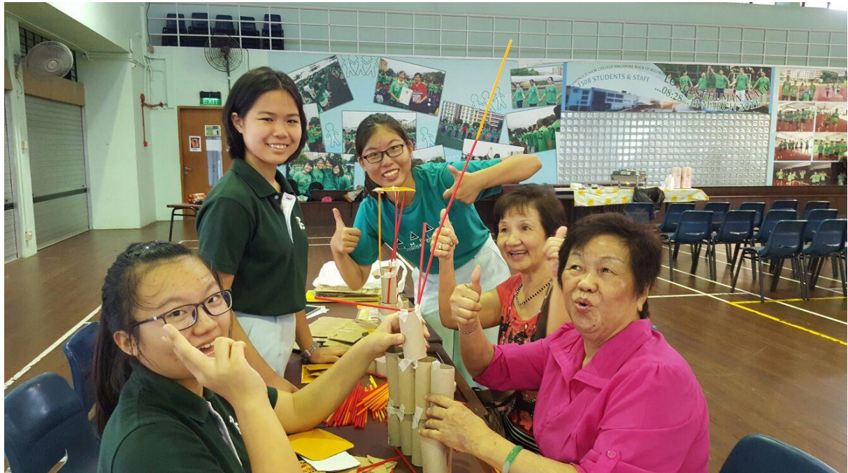
The elderly and Interactors building a tower with recycled materials

After the event, many of the elderly thanked students of both Shooting and Interact Club for their efforts. As a result, the planning and execution for the carnival had deepened the Interactors' sense of belonging to the club, and also the Shooting Club members' community spirits.