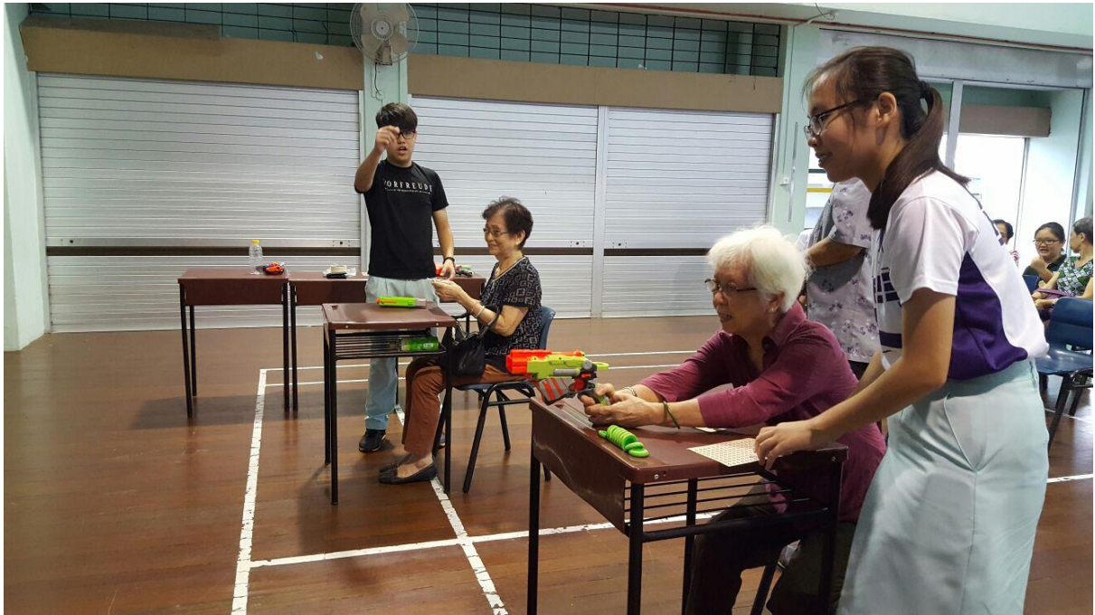
Shooting Club members guiding the elderly in nerf gun shooting