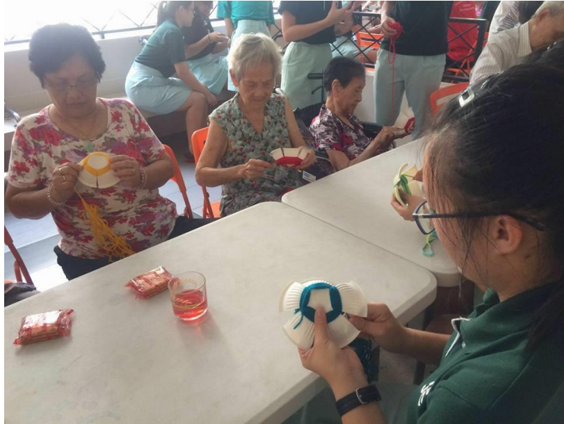
The elderly doing bowl weaving during an art and craft session with the interactors